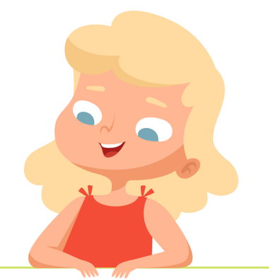
Make sure you have the best life chances and can grow up happy and successful.